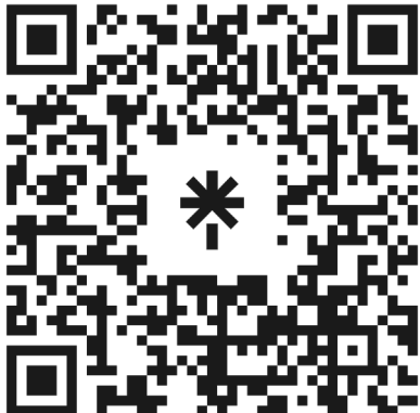
Scan the QR Code to connect with VAD

Through the Vaccine Acceptance & Demand Initiative's Vaccination Acceptance Research Network, Sabin supports experts in exploring the factors that can drive vaccination acceptance, demand, delivery, and uptake in low-resourced settings. To learn more about the initiative and its programs, scan the QR code below.